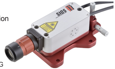
Sensor head SP 15000 NG